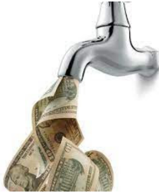
Cash Flow Management Nov 4