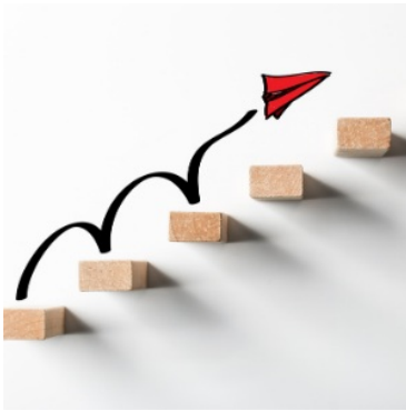
Learn How to Sell Better Oct 28