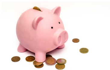
Financing a Small Business Nov 18