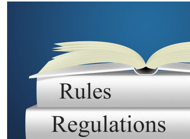
All Things Legal for Small Businesses Nov 11