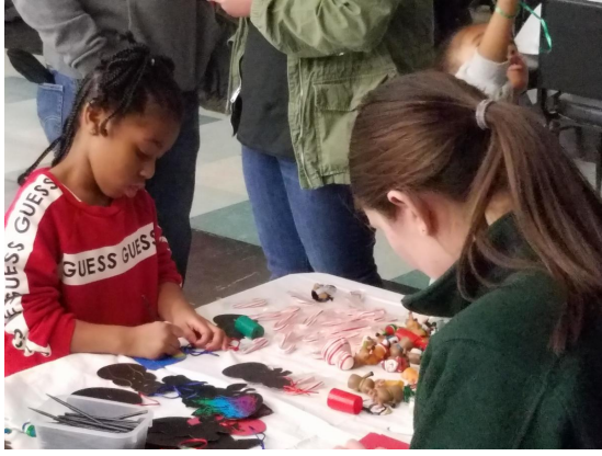
Annual Christmas Party at Prince Hall an event Greater Grove Hall Main Streets Co-Sponsors. Helping is a volunteer from Franklin Park Zoo.