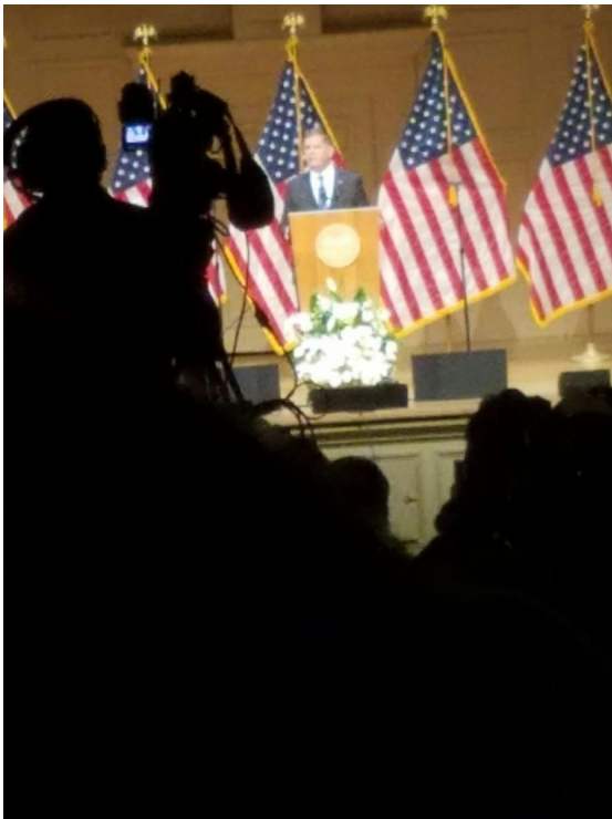
Mayor Walsh State of the city