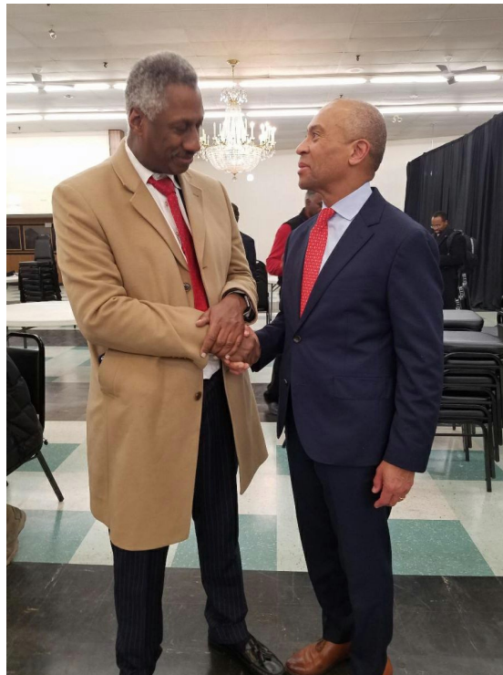
Governor and presidential candidate Patrick Deval comes to Prince Hall Masonic Lodge