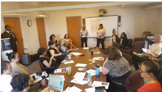
Main Street Directors meeting with city officials.