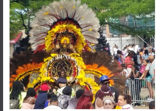
Marchers in the Caribbean festival