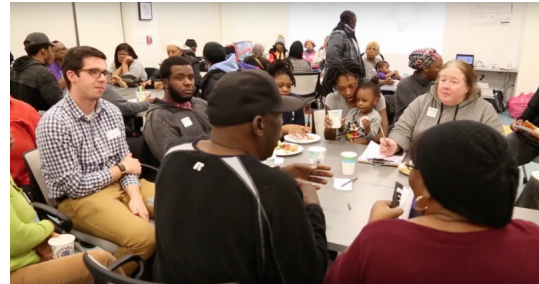
Table Talks at UCB Network Nights are a great place to bring a community concern or an organizational challenge you are trying to solve. Check out upcoming dates happening all over Boston:

October 9 & 23, 5:30 -7:30 PM KIPP Academy 37 Babson St. Mattapan, MA 02126