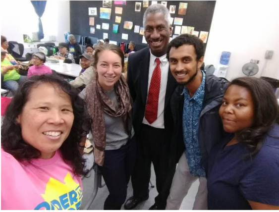
Some of those participating in the walk audit of Grove Hall