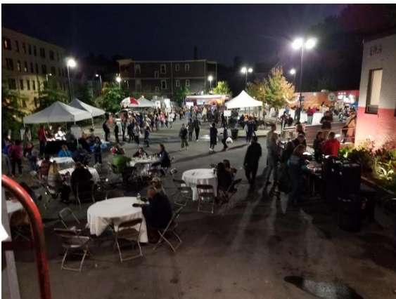
Friday Night Bites CWK Commonwealth Kitchen. Great event in the neighborhood to help the community and provide Food Entrepreneurs an opportunity to sell their products.