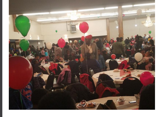
Community Christmas party sponsored by Prince Hall Masonic Lodge and Greater Grove Hall Main Streets