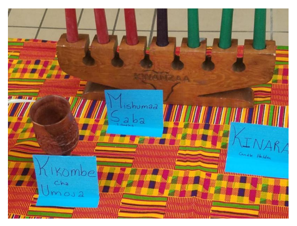
Part of Kwanzaa celebration sponsored by Greater Grove Hall Main Streets and 22 other organizations