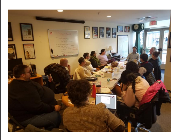
Boston Main Streets directors meeting with members of the Massachusetts Recreational Consumer Council a helping community groups deal with the cannabis industry in local neighborhoods