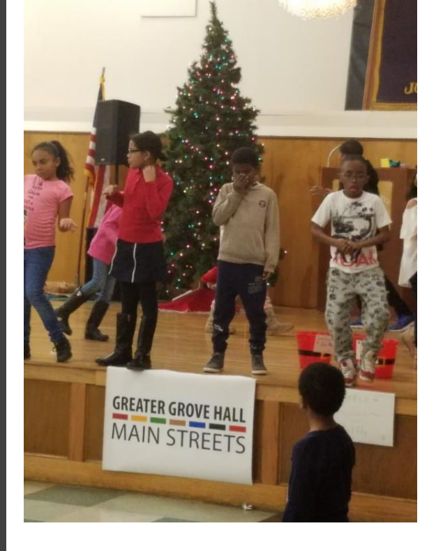
Christmas party for United Housing residents that Greater Grove Hall Main Streets was able to co-sponsor