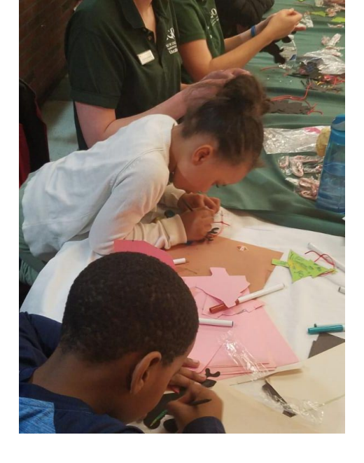
Child participating in arts and crafts activity at Community Christmas party sponsored by Prince Hall Masonic Lodge and Greater Grove Hall Main Streets (Pictured in background volunteers from Franklin Park Zoo)