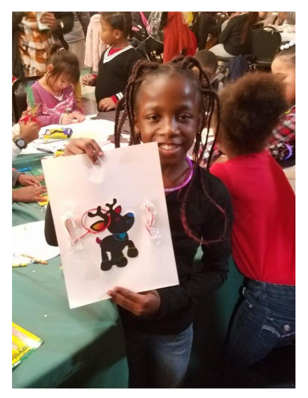
A child from United Housing who just completed an arts and crafts project sponsored by Franklin Park Zoo