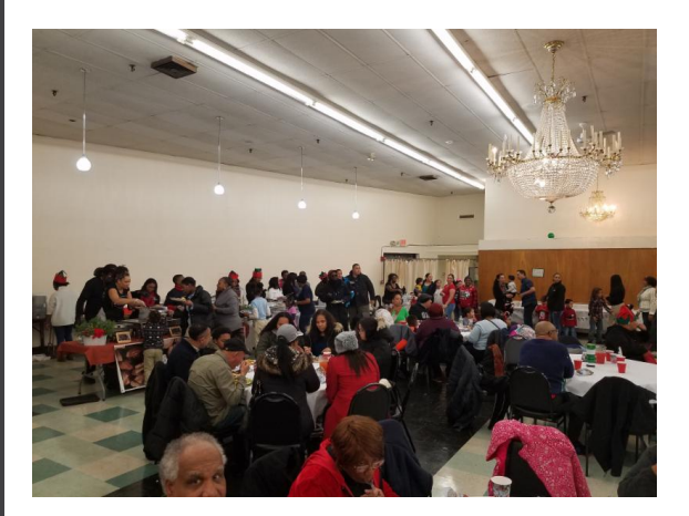
Residents of United Housing at their Annual Christmas program co sponsored by Greater Grove Hall Main Streets