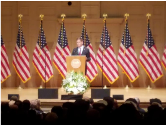
Because of the close relationship between the Main Streets and the City of Boston, Main Street Executive Directors are invited to the Mayor's annual state of the city event.