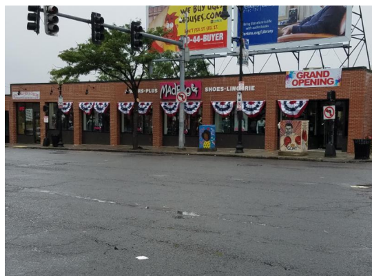
Grand Opening of Madrags