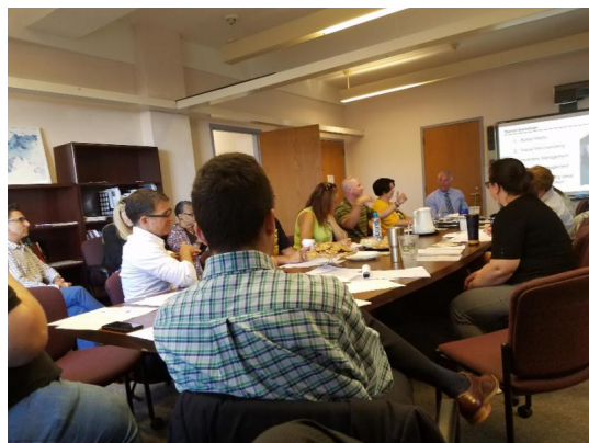
Monthly director's meeting