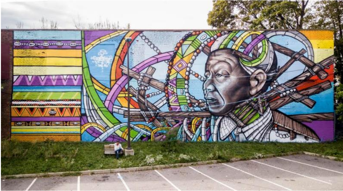
Powerful Knowledge Mural