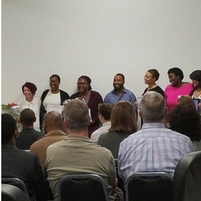
The latest cohort from Fairmount Innovation Lab, graduation ceremony. For more information on the Fairmount Innovation Lab go to www.lab584.org .

Greater Grove Hall 320 A Blue Hill Ave. Dorchester, MA 02121 617-427-2560