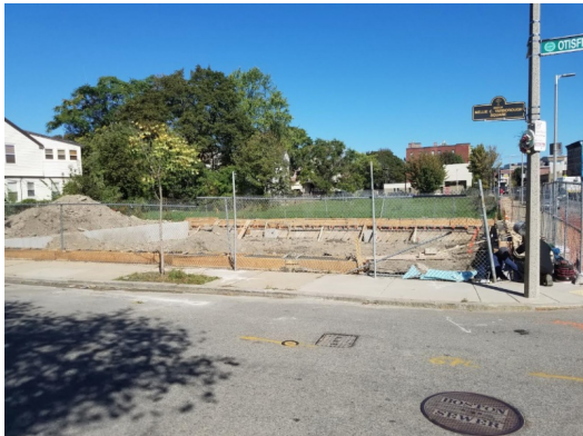
Thomas Construction has started work on a new laundrymat for the area.