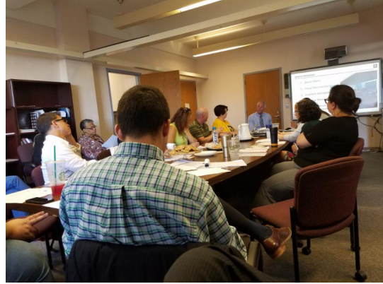
Monthly director meeting with the city of Boston.