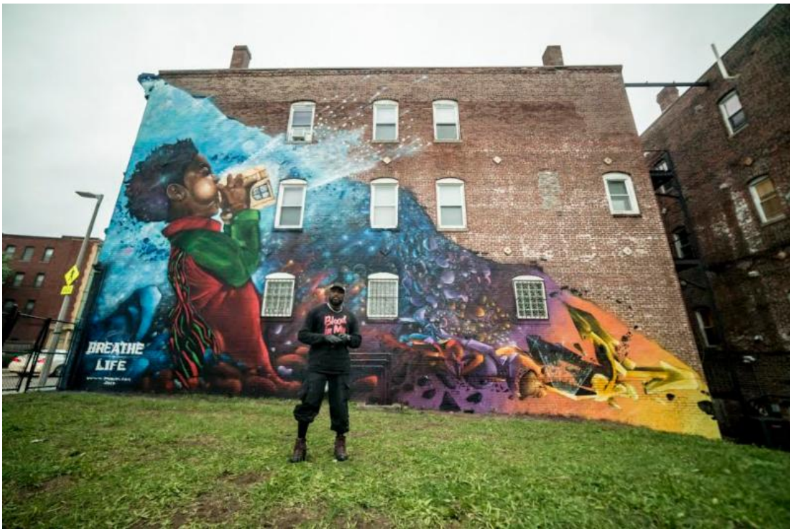
Breathe Life Mural