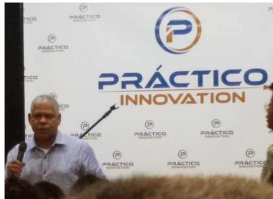
Greater Grove Hall Main Streets was invited to participate in an annual pitch event for those in the indivisible community. This was a great program for start-ups started by people of color. Learn more: practicoinnovation.com .