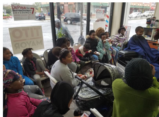
Mattapan's Finest 8th Annual Cut & Curl event. Greater Grove Hall Main Streets is a major sponsor of this event where girls get free press and curls and boys get free haircuts as part of a back to school campaign.