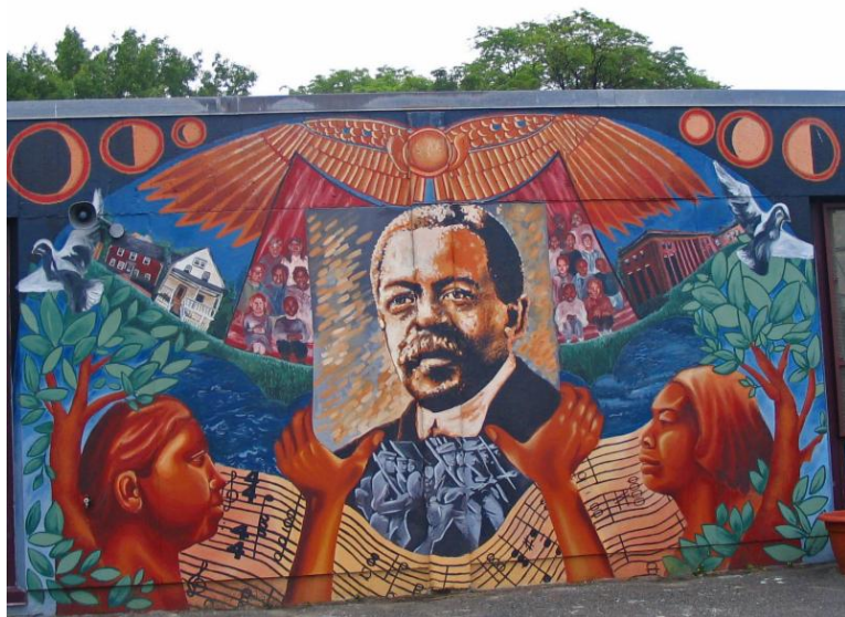
William Monroe Trotter mural