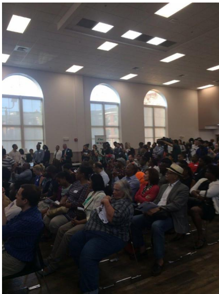
A partial view of the crowd.