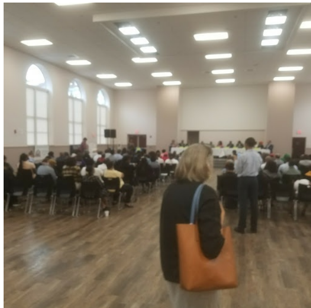
Candidates forum for District 7 City Council race.

Greater Grove Hall 320 A Blue Hill Ave. Dorchester, MA 02121 617-427-2560