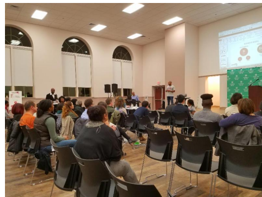
The owner of Munchiees pitching at the pitch contest