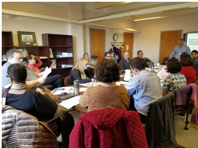
Monthly director meeting with the city of Boston.