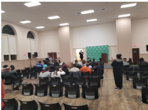
LISC Pitch Contest