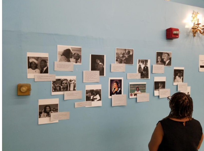
Photos of Rev. Dr. Martin Luther King and Coretta Scott King to inspire participants.