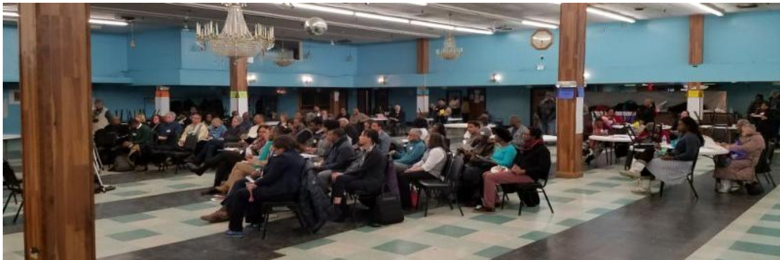
A view of the community who came out to express their ideas for the MLK Memorial.