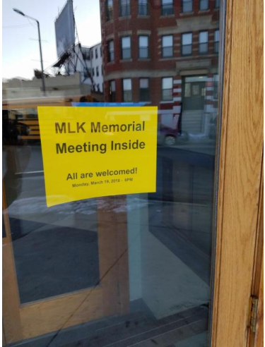
The following series of photos are from the MLK Event where 140 people from the community came out to express their thoughts on the proposed MLK Memorial in Boston.