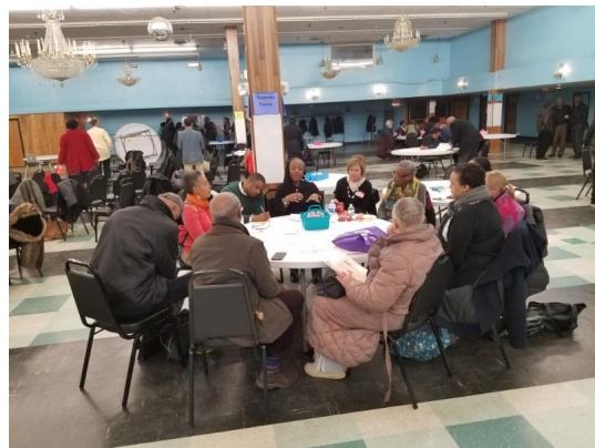
Participants meeting in small groups to discuss Fundraising, Theme, Artistic Vision, Programming, Location