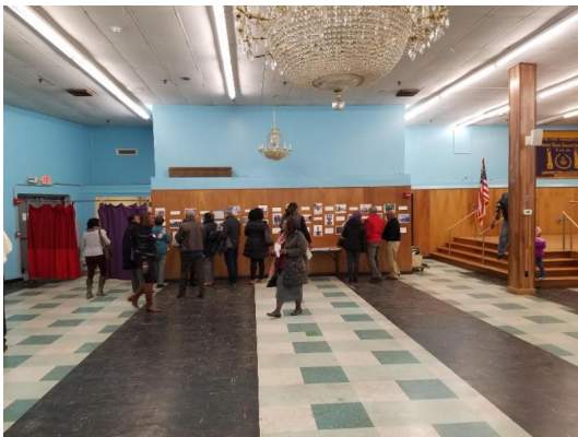
People looking at MLK Memorials from around the world and voting on their favorites.