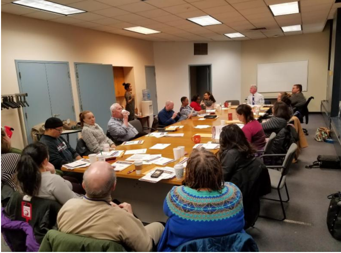
Boston Main Streets monthly directors meeting