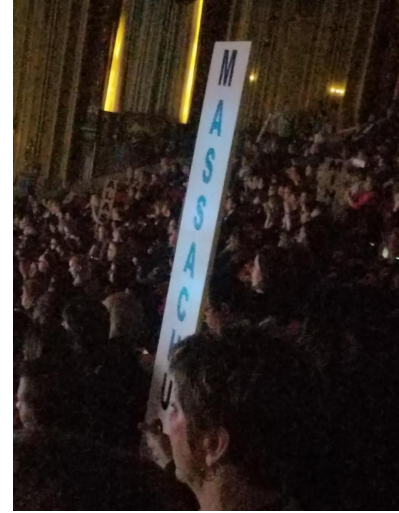
The Massachusetts delegation at the National Main Street conference

Greater Grove Hall 320 A Blue Hill Ave. Dorchester, MA 02121 617-427-2560