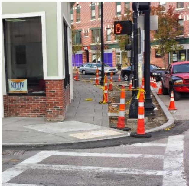
New sidewalks for Greater Grove Hall, City of Boston.