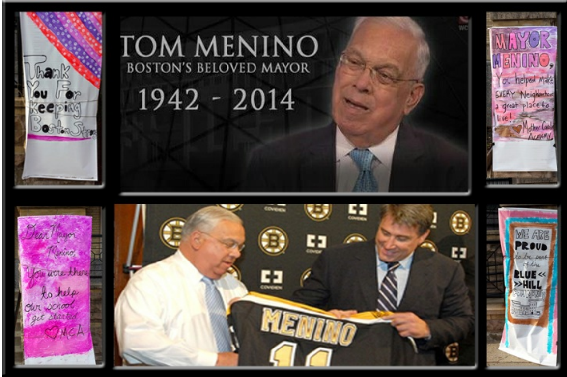
(Left sidebar and Right sidebar) Photos from the day the mayor's funeral processed through Grove Hall.