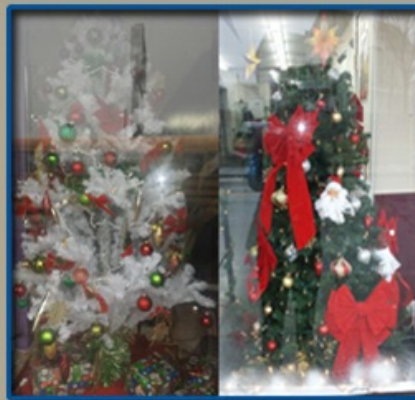
TREE # 2