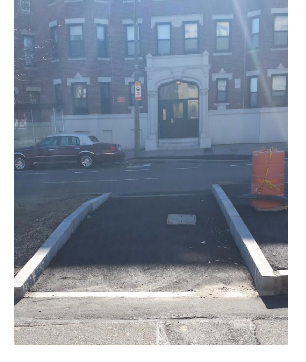
At long last, a crosswalk going in at Mother Caroline Academy.

sponsored by A Better City and MA Smart Growth Alliance. This was a very useful workshop that covered various aspects of placemaking such as pop-up parks, street murals, wayfinding signs, etc. These are projects that can improve the community that are relatively inexpensive.