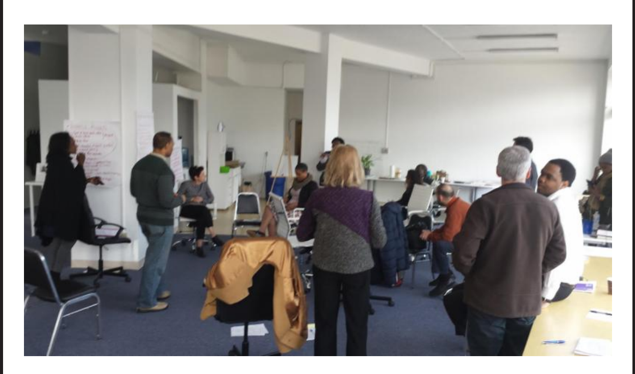
Fairmont innovation Network meeting