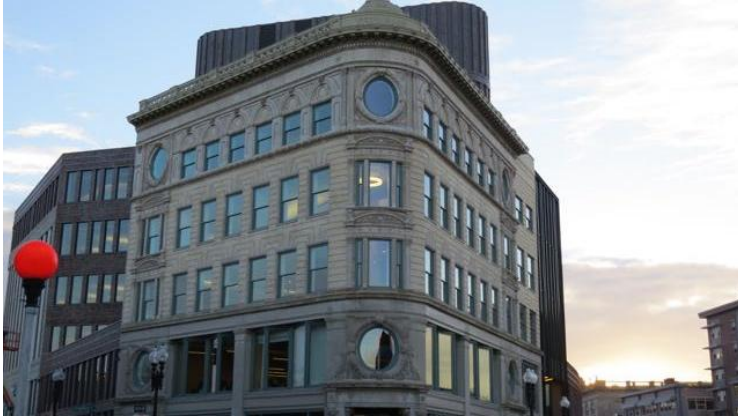
Roxbury Innovation Center

The Roxbury Innovation Center is offering three courses for young students, two of which are free: the Introduce and Explore Workshop , the Introduction to CAD Workshop , and the Mbadika Youth Workshop .