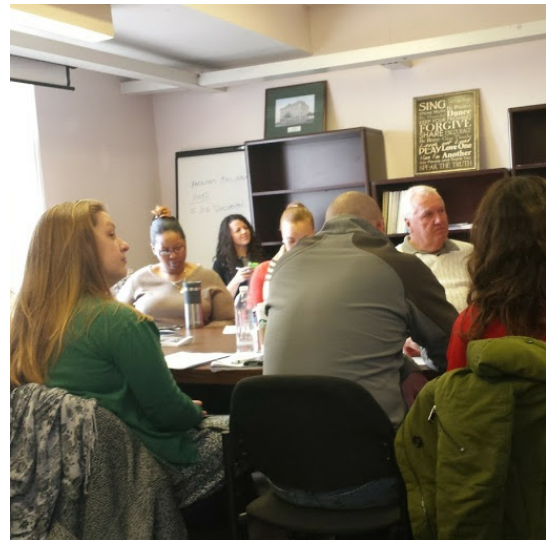
Main Street Executive Director Meeting

Greater Grove Hall 320 A Blue Hill Ave. Dorchester, MA 02121 617-427-2560