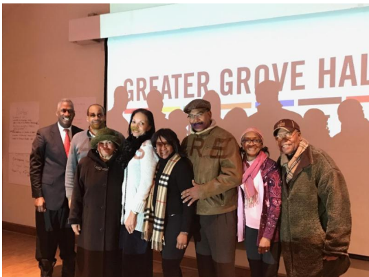
Photo from the Greater Grove Hall Main Streets retreat.