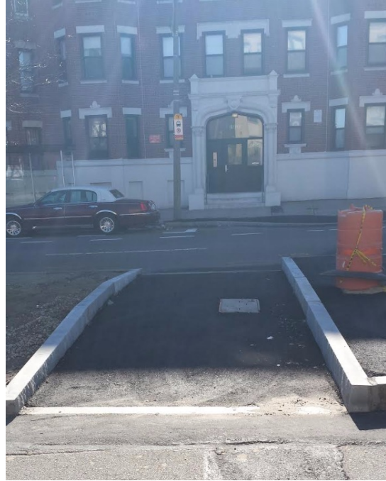
At long last, a crosswalk going in at Mother Caroline Academy.

sponsored by A Better City and MA Smart Growth Alliance. This was a very useful workshop that covered various aspects of placemaking such as pop-up parks, street murals, wayfinding signs, etc. These are projects that can improve the community that are relatively inexpensive.