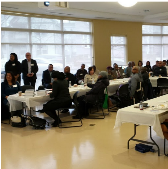
Community meeting at Delegates Breakfast at the Thomas Atkins building in Grove Hall