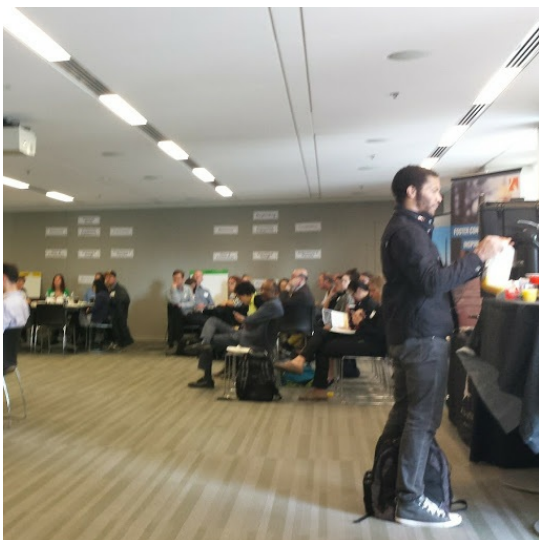
Photo at the Routes to Placemaking Workshop