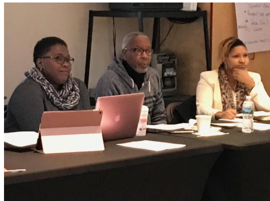
Photo from the Greater Grove Hall Main Streets retreat.