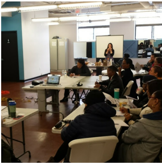
Presentation on Facebook for small businesses, providing technical assistance to small businesses on the use of social media.