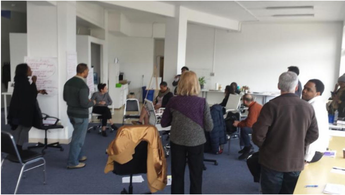
Fairmont innovation Network meeting