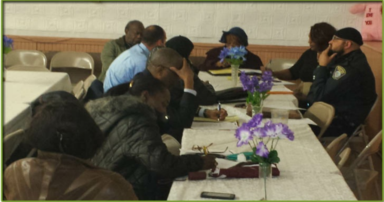
COMMUNITY MEETING DISCUSSING DEVELOPMENT OF PROPERTY ON SEVER STREET AND BLUE HILL.