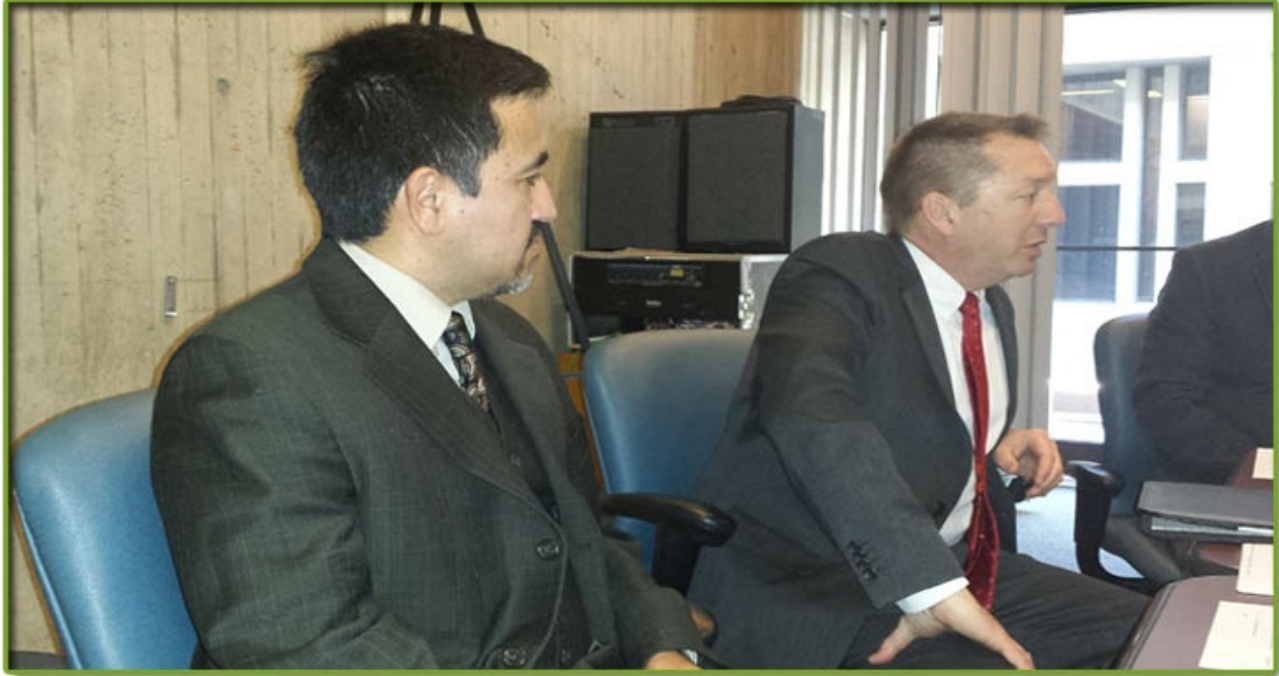
MASS GROWTH CAPITAL , SNOW STORM LOAN FUND